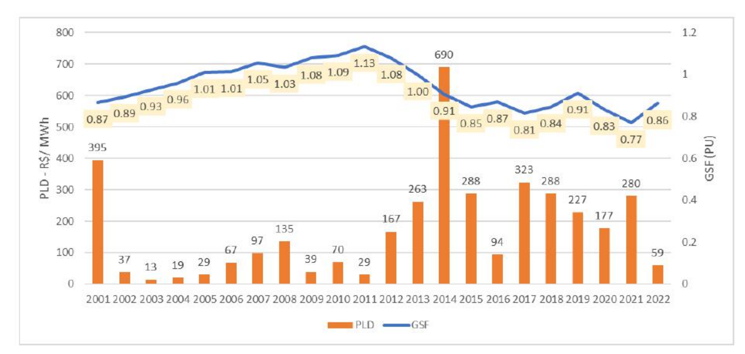
PLD – Spot Price (Preço de Liquidação de Diferenças, or 'PLD'))

In 2022, the average GSF stood at 0.86 still impacted by a hydrological condition below the historical average and lower reservoir levels. The chart below presents the average price and GSF for the periods shown: